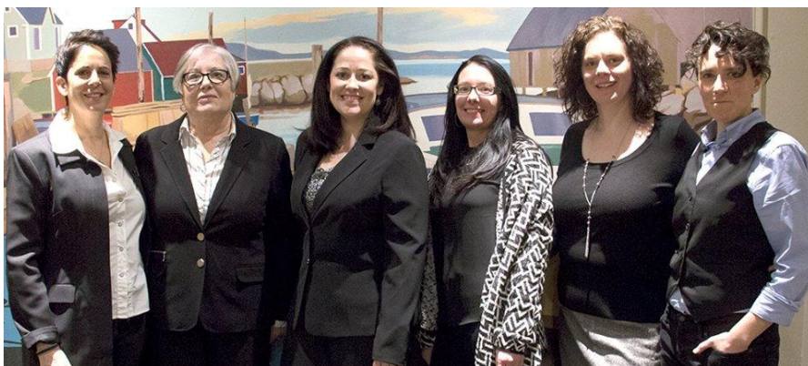
Alice Housing Staff 2014-2015